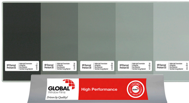
Assembled display with aluminum base and all labels centered and balanced perfectly.